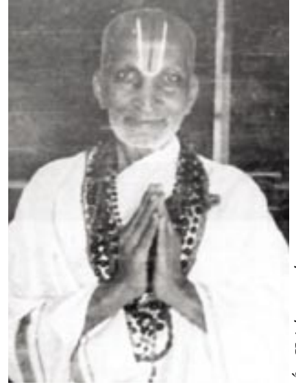
Śrī Krishnamacharya.